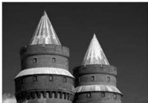
The Bronx's Kingsbridge Armory.

A long-empty landmark building in the Northwest Bronx is set to become what is being billed as the largest indoor ice-skating center in the world, according to a plan approved by the New York City Council this December in a 48-1 vote. The 720,000-square-foot Kingsbridge National Ice Center will feature a suite of nine rinks, including a 5,000-seat rink for international competitions. It will attract the world's greatest athletes, say its backers, who include former New York Rangers star Mark Messier and figure skating Olympic gold medalist Sarah Hughes.