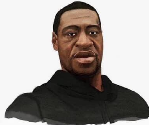
GEORGE FLOYD #JUSTICEFORFLOYD