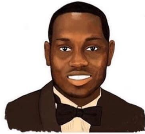
AHMAUD ARBERY May 8, 1994 - February 23, 2020