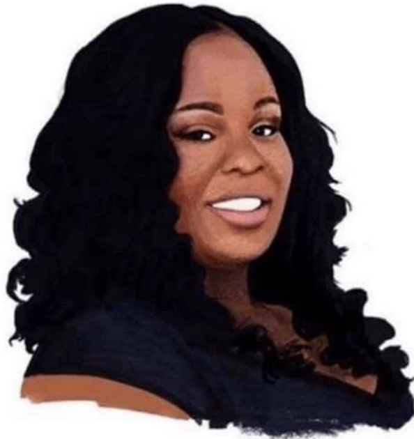
BREONNA TAYLOR June 5, 1993 - March 13, 2020